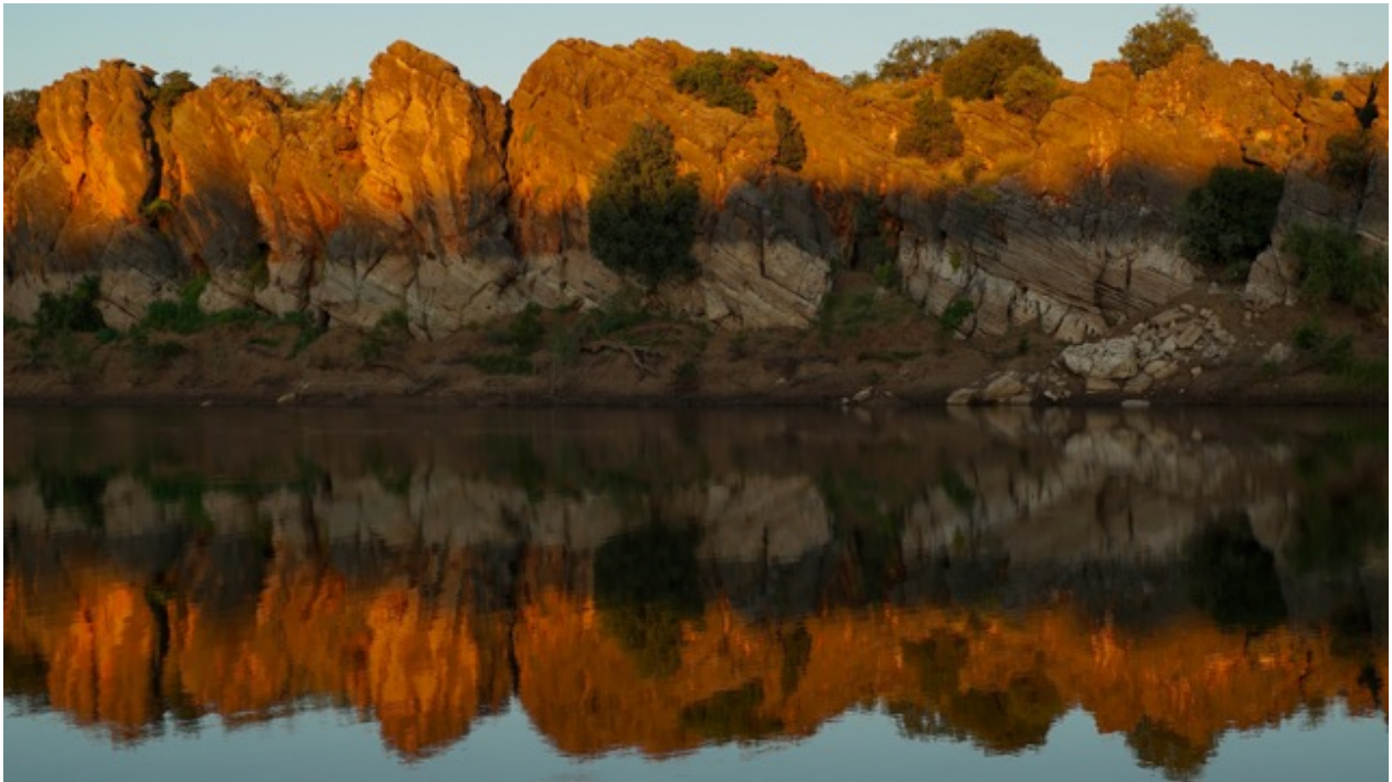
Geike Gorge on the Fitzroy River