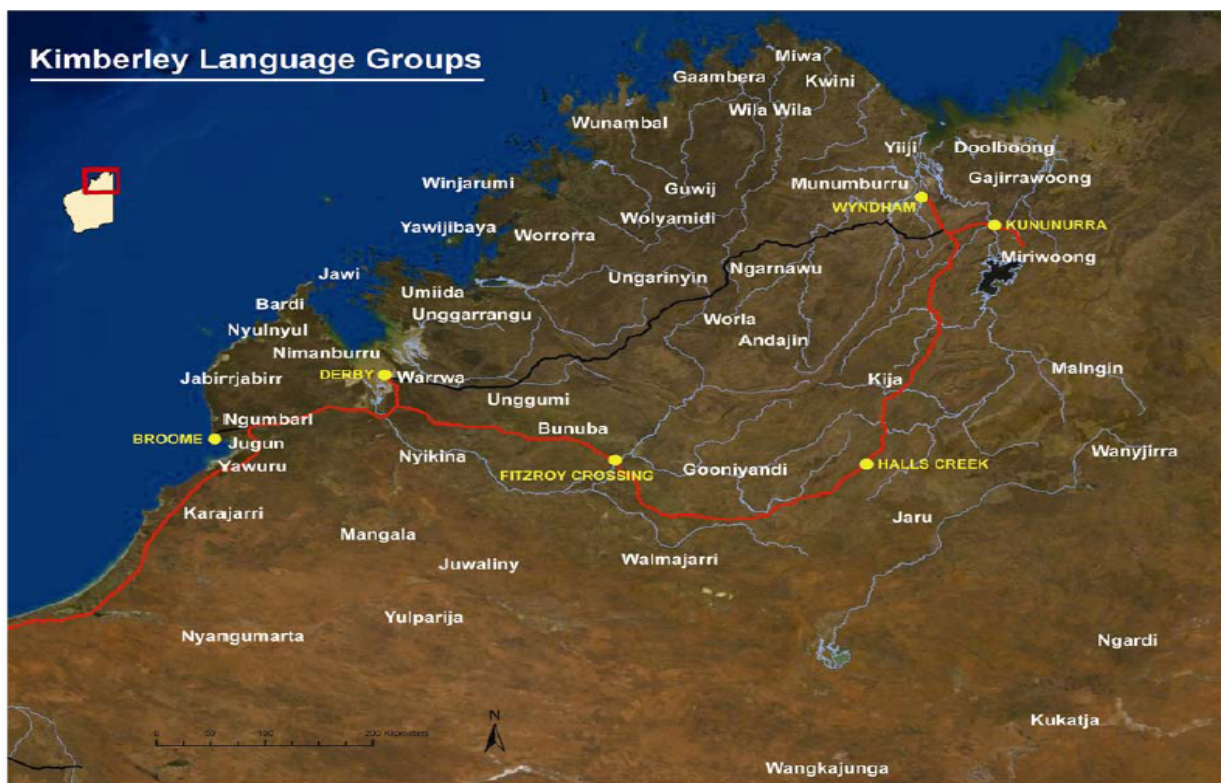
Kimberley language groups (Kimberley Language Resource Centre)

The Kimberley region of North Western Australia covers an area of 420,000 km 2 and is recognised as one of the world's most ecologically diverse areas, with one of the last pristine coastlines left on Earth. 75 per cent of long-term residents are Indigenous, from 34 different language groups (or nations), which comprise the oldest surviving culture in the world. Their stories and ecological knowledge are recorded in tens-of-thousands of rock art sites dotted across the dramatic Kimberley landscape. Approximately half the Indigenous population now lives in 200 remote Aboriginal communities varying in size from 20 to 900 people.