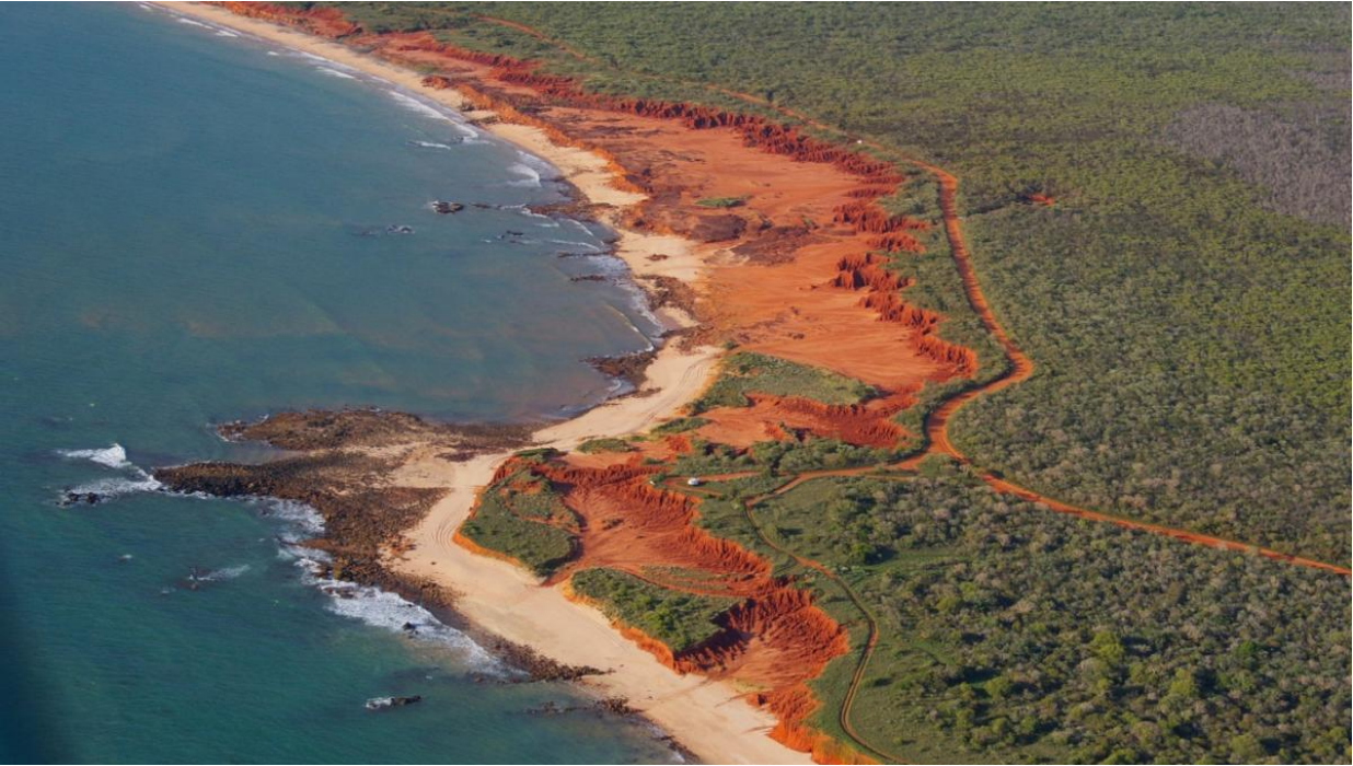
Walmadany, or James Price Point

The Kimberley is an epic and dramatic place, making this film a truly cinematic documentary. We spend time getting to know our characters on Country, hearing the stories which make the landscape such a unique cultural asset, and we dig deeper into the political machinations behind successive waves of policy which have been disadvantaging Aboriginal people since colonisation. This is a complex and urgent story which demands the attention of all Australians and indeed the world.