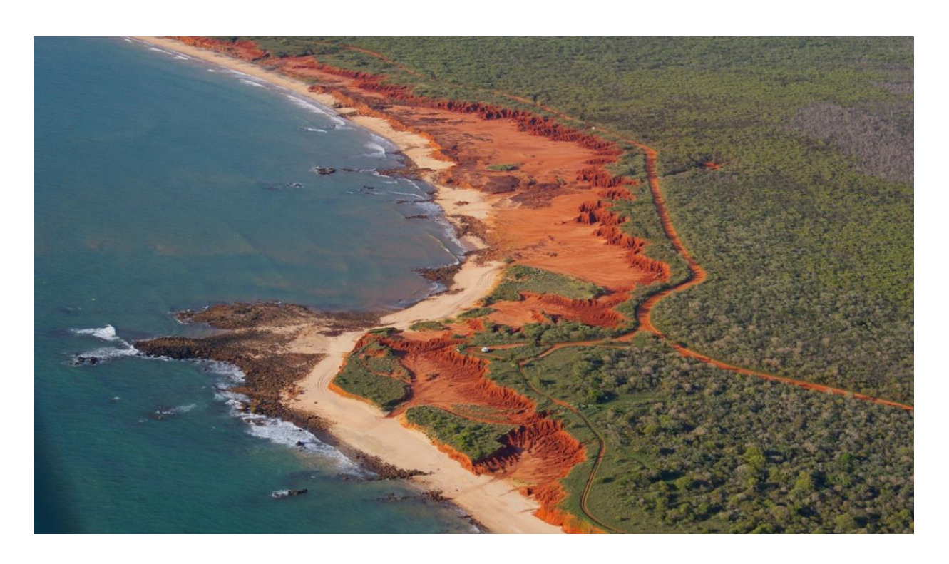
Walmadany, or James Price Point

The Kimberley is an epic and dramatic place, making this film a truly cinematic documentary. We spend time getting to know our characters on Country, hearing the stories which make the landscape such a unique cultural asset, and we dig deeper into the political machinations behind successive waves of policy which have been disadvantaging Aboriginal people since colonisation. This is a complex and urgent story which demands the attention of all Australians and indeed the world.