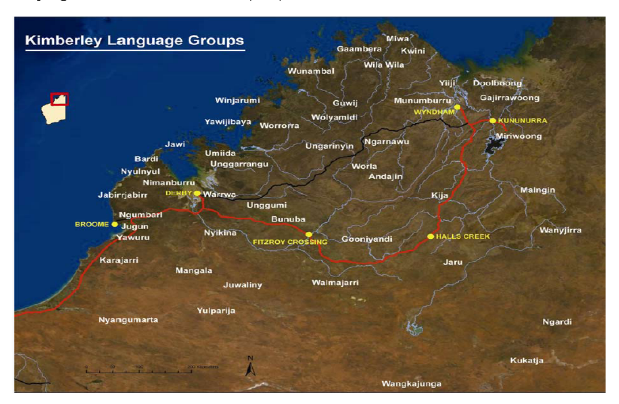
Kimberley language groups (Kimberley Language Resource Centre)

The Kimberley region of North Western Australia covers an area of 420,000 km² and is recognised as one of the world's most ecologically diverse areas, with one of the last pristine coastlines left on Earth. 75 per cent of long-term residents are Indigenous, from 34 different language groups (or nations), which comprise the oldest surviving culture in the world. Their stories and ecological knowledge are recorded in tens-of-thousands of rock art sites dotted across the dramatic Kimberley landscape. Approximately half the Indigenous population now lives in 200 remote Aboriginal communities varying in size from 20 to 900 people.