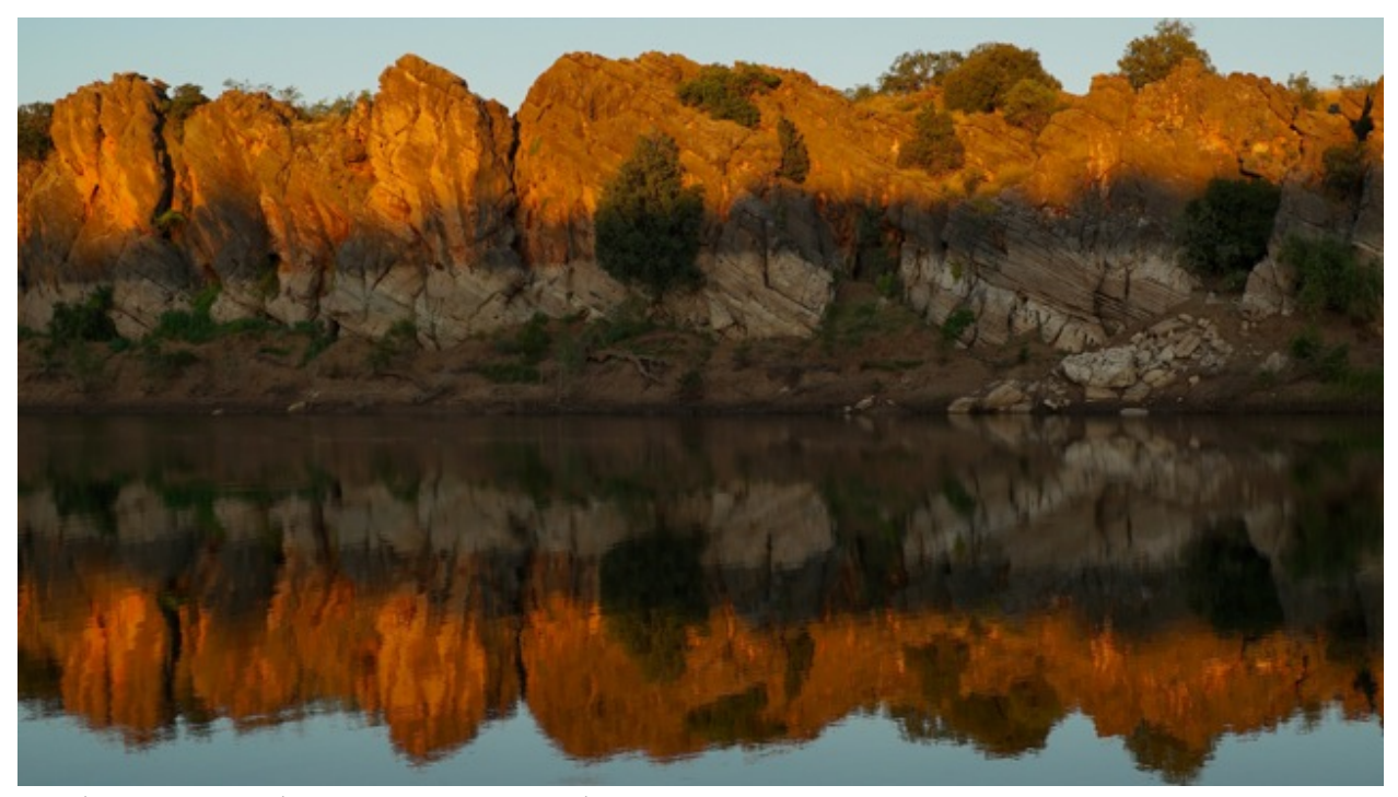
Geike Gorge on the Fitzroy River